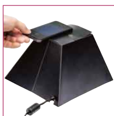
Use your phone to capture an image