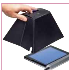
Supplied with a flatpack hood